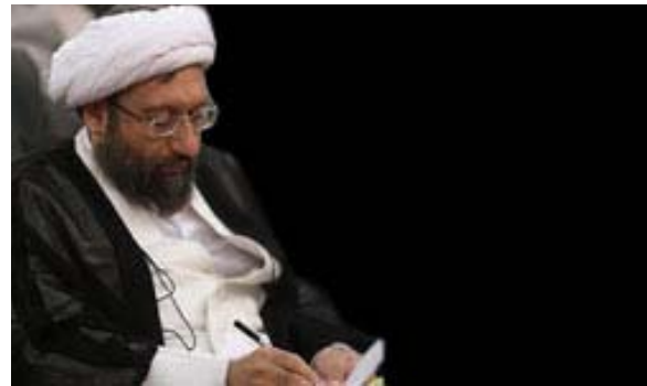
Ayatollah Sadegh Larijani, New Head of the Judiciary.